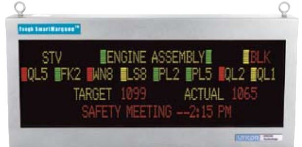
Master Tough SmartMarquee

Control Network e.g. DH+, Ethernet I/P etc. Tough SmartMarquee acts as an Intelligent device on one of the network nodes.