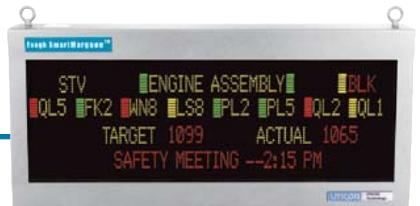
Slave Tough SmartMarquee