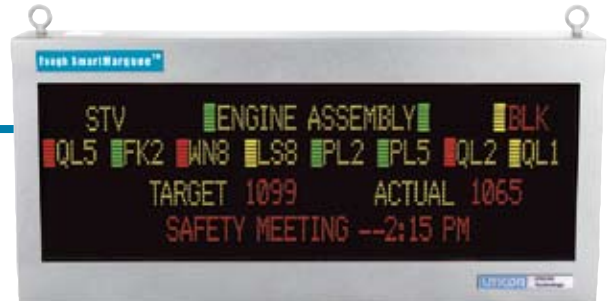
Slave Tough SmartMarquees

IPC with SCADA Software or a Master PLC sending ASCII strings